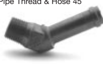
AS 5186 AN 844 ELBOW Pipe Thread & Hose 45°