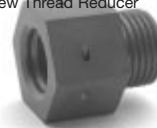
AS 5172 AN 893, MS 24397 BUSHING Screw Thread Reducer