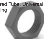
AS 5179 AN 6289 NUT Flared Tube, Universal Fitting