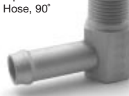
MS24519, J 1231 ELBOW Pipe Thread & Hose, 90°