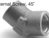
AS 5191 AN 941 ELBOW Internal Screw, 45°