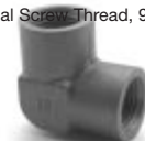
AS 5190 AN 939 ELBOW Internal Screw Thread, 90°