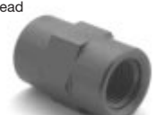
NAS 424 COUPLING Tube Flare Fitting, Female Thread