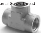
AS 5192 AN 938 TEE Internal Screw Thread