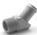
MS 24518, J 1231 ELBOW Pipe Thread & Hose, 45°