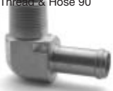
AS 5185 AN 842 ELBOW Pipe Thread & Hose 90°