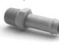
MS 24522, J 1231 ADAPTER Hose Ti Pipe Thread